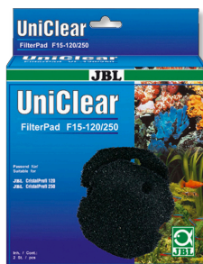
JBL FilterPad F15 Coarse foam pad for aquarium filter CristalProfi