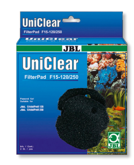
JBL FilterPad F15 Coarse foam pad for aquarium filter ĊristalProfi