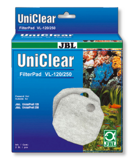
JBL FilterPad VL Cotton fleece for CristalProfi aquarium filters