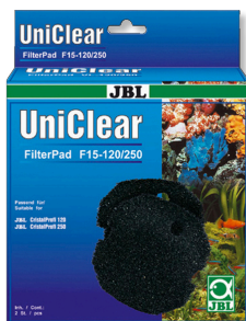
JBL FilterPad F15 Coarse foam pad for aquarium filter CristalProfi