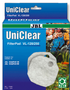
JBL FilterPad VL Cotton fleece for CristalProfi aquarium filters