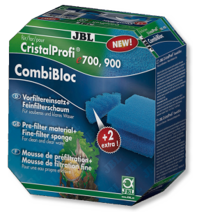
JBL CombiBloc CristalProfi e Pre-filter pads and filter foam for CristalProfi e