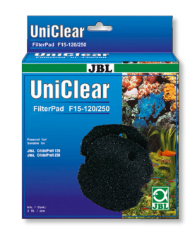
JBL FilterPad F15 Coarse foam pad for aquarium filter ĊristalProfi