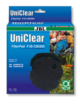
JBL FilterPad F35 Fine foam pad for aquarium filter CristalProfi