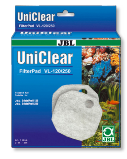
JBL FilterPad VL Cotton fleece for CristalProfi aquarium filters