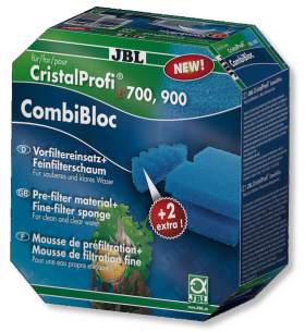
JBL CombiBloc CristalProfi e Pre-filter pads and filter foam for CristalProfi e