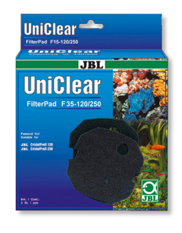
JBL FilterPad F35 Fine foam pad for aquarium filter CristalProfi