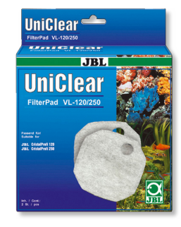
JBL FilterPad VL Cotton fleece for CristalProfi aquarium filters