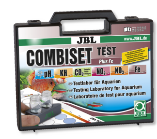
JBL Test Combi Set plus Fe Test case with most important water tests + iron test

You can find a complete overview here: https://www.jbl.de/gr/25370