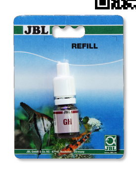
JBL GH Test Quick test to determine the total hardness