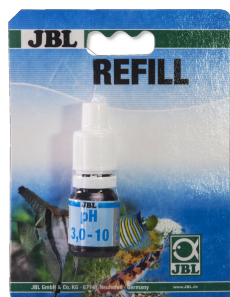
JBL pH Test 3.0-10.0 Quick test to determine the acidity