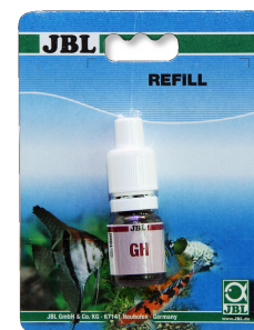
JBL GH Test Quick test to determine the total hardness