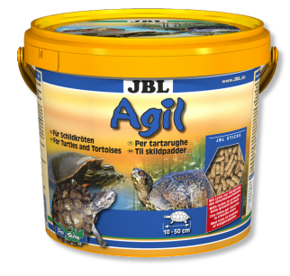
JBL Agil Main foodsticks for turtles 10 – 50 cm in size