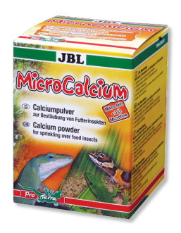
JBL MicroCalcium Mineral supplementary food for all reptiles