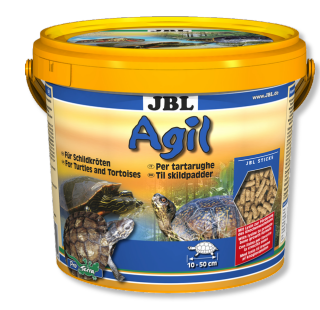
JBL Agil Main foodsticks for turtles 10 -50 cm in size