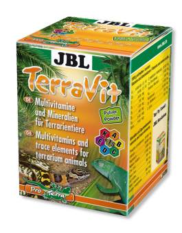
JBL TerraVit Powder Vitamins and trace elements for terrarium animals