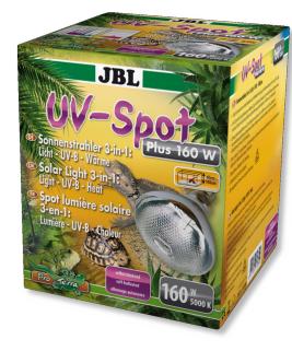
JBL UV-Spot plus UV spotlight with daylight spectrum for terrariums