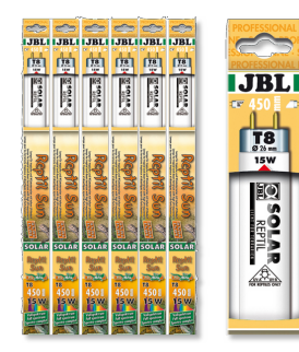
JBL SOLAR REPTIL SUN T8 Special T8 terrarium fluoresc. tube for desert animals