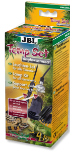
JBL TempSet angle+ connect Installation kit for lamps in terrariums