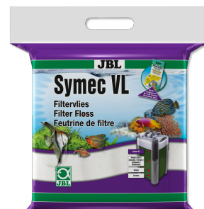
JBL Symec VL Filter wool fleece to remove water cloudiness