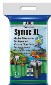
JBL Symec XL Coarse filter wool to remove all types of water cloudiness