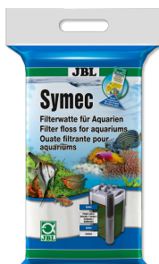
JBL Symec Filter floss Filter wool to remove all types of cloudiness