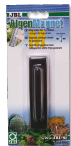
JBL Algae Magnet Magnetic glass cleaner for aquarium panes