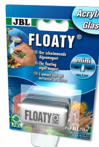
JBL FLOATY acrylic/glass Floating acrylic pane cleaning magnet