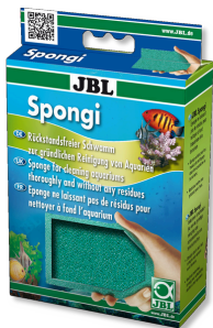
JBL Spongi Cleaning sponge for aquariums and terrariums