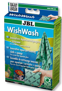
JBL WishWash Cleaning cloth and sponge