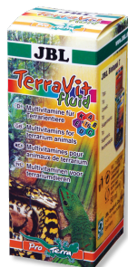
JBL TerraVit fluid Vitamins and trace elements for terrarium animals