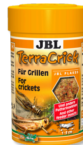
JBL TerraCrick Complete food for feeder insects