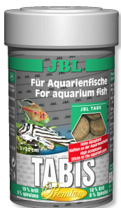
JBL Tabis Premium food tablets for freshwater and marine fish