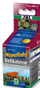
JBL NanoTabs Main food for shrimp and dwarf crayfish