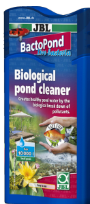
JBL BactoPond Bacteria for biological purification of the pond