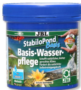
JBL StabliPond Basis Basic care product for all garden ponds