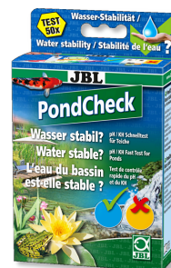
JBL PondCheck Quick test to determine the pH and KH values