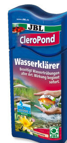
JBL CleroPond Water clarifier for the elimination of water cloudiness