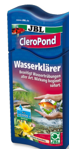
JBL CleroPond Water clarifier for the elimination of water cloudiness