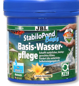
JBL StabiloPond Basis Basic care product for all garden ponds