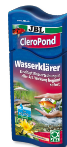
JBL CleroPond Water clarifier for the elimination of water cloudiness