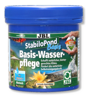
JBL StabiloPond Basis Basic care product for all garden ponds