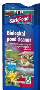
JBL BactoPond Bacteria for biological purification of the pond