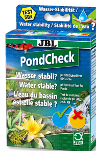
JBL PondCheck Quick test to determine the pH and KH values