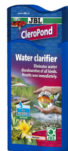
JBL CleroPond Water clarifier for the elimination of water cloudiness