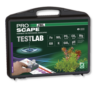
JBL Testlab ProScape Test case for water analysis in plant aquariums