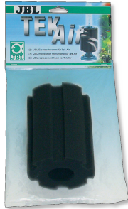
JBL TekAir Filter Sponge Black, fine High-quality sponge for aquarium filter TekAir