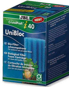
JBL CP i40/TekAir UniBloc blue Foam cartridge for Cristal Profi i40 and TekAir