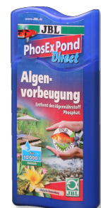
JBL PhosEX Pond Direct Phosphate remover for ponds