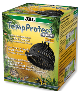
JBL TempProtect light Reptile thermal burn protection for JBL TempSets