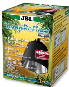
JBL TempReflect light Reflector screen for energy- saving lamps