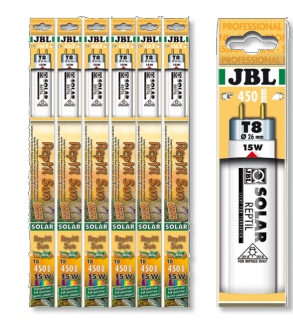
JBL SOLAR REPTIL SUN Τ8 Special T8 terrarium fluoresc. tube for desert animals