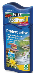
JBL AccliPond Water conditioner for ponds