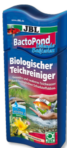
JBL BactoPond Bacteria for biological purification of the pond