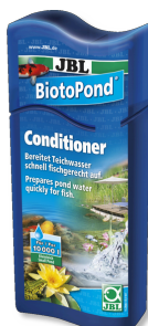
JBL BiotoPond Water conditioner for ponds