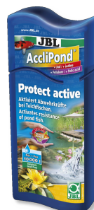
JBL AccliPond Water conditioner for ponds