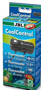
JBL CoolControl Thermostat to regulate cooling fan