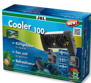
JBL Cooler 100 Cooling fan for fresh- and saltwater aquariums