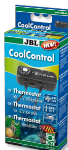
JBL CoolControl Thermostat to regulate cooling fan