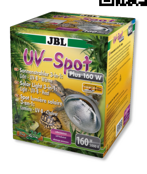
JBL UV-Spot plus UV spotlight with daylight spectrum for terrariums