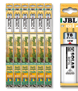
JBL SOLAR REPTIL JUNGLE T8 T8 terrarium fluorescent tube for rainforest animals