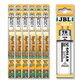
JBL SOLAR REPTIL SUN Τ8 Special T8 terrarium fluoresc. tube for desert animals