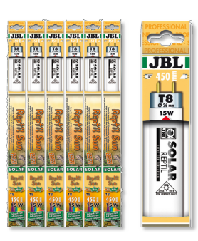
JBL SOLAR REPTIL SUN T8

T8 terrarium fluorescent tube for rainforest animals