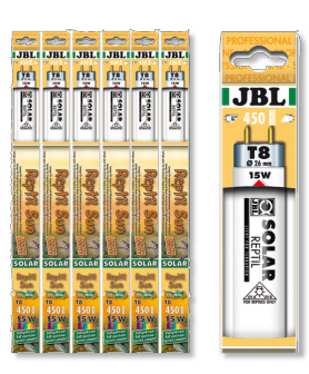
JBL SOLAR REPTIL SUN T8

T8 terrarium fluorescent tube for rainforest animals