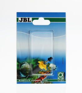
JBL CP i 60/80 greenline impeller