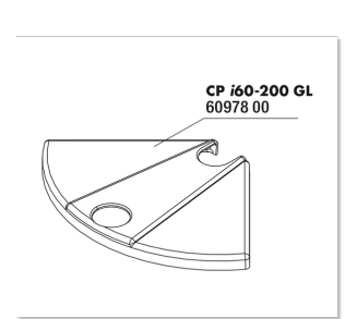
JBL CPi greenline Pump HC