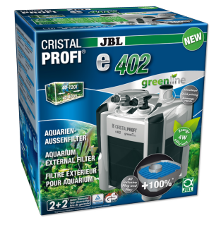
JBL CRISTALPROFI e402 greenline External filter for aquariums from 40-120 litres