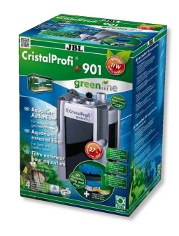
JBL CristalProfi e901 greenline External filter for aquariums from 90 - 300 litres