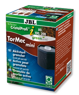
JBL Tormec CristalProfi i60/80/100/200 Active peat granulate for CristalProfi i