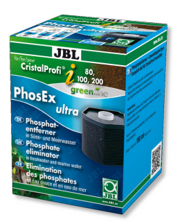
JBL PhosEx Ultra CristalProfi i60/80/100/200 Phosphate remover cartridge for JBL CristalProfi i