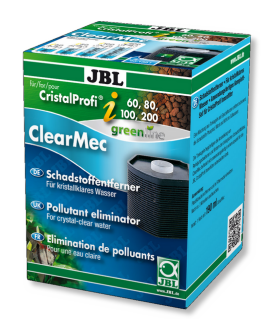
JBL Clearmec CristalProfi i60/80/100/200 Nitrite, nitrate and phosphate eliminator for CP i