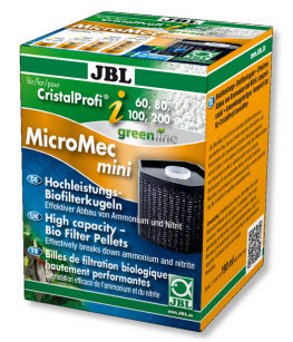
JBL MicroMec CristalProfi i60/80/100/200 High-performance filter balls for CristalProfi i