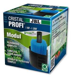
JBL CRISTALPROFI i greenline module Filter module for internal filter series CristalProfi i