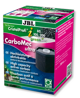
JBL CarboMec ultra Pad CristalProf i60/80/100/200 Filter insert with activated carbon for CP i range