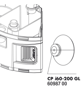
JBL CP i_gl special suction cup