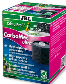
JBL CarboMec ultra Pad CristalProfi i60/80/100/200 Filter insert with activated carbon for CP i range