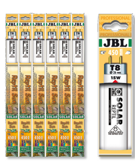
JBL SOLAR REPTIL SUN T8

T8 terrarium fluorescent tube for rainforest animals