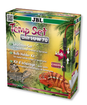
JBL TempSet Unit L-U-W Installation kit for metal-halide lamps