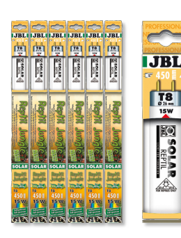
JBL SOLAR REPTIL JUNGLE T8

T8 terrarium fluorescent tube for rainforest animals