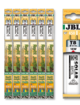
JBL SOLAR REPTIL JUNGLE T8

T8 terrarium fluorescent tube for rainforest animals