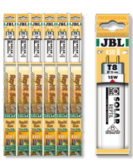
JBL SOLAR REPTIL SUN T8

T8 terrarium fluorescent tube for rainforest animals