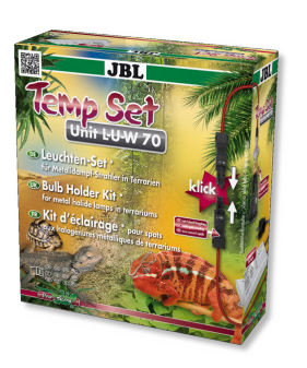
JBL TempSet Unit L-U-W Installation kit for metal-halide lamps