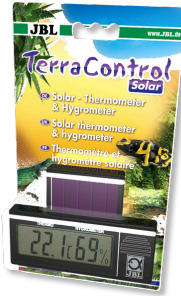
JBL TerraControl Solar Solar-powered thermometer + hygrometer for terrariums