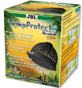
JBL TempProtect II light Reptile thermal burn protection for JBL TempSet items