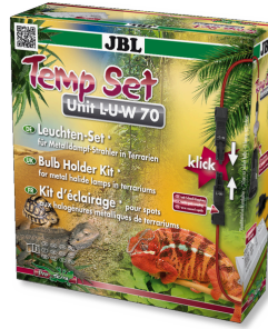
JBL TempSet Unit L-U-W Installation kit for metal-halide lamps