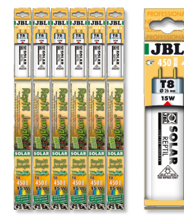
JBL SOLAR REPTIL JUNGLE T8 T8 terrarium fluorescent tube for rainforest animals