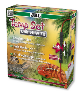
JBL TempSet Unit L-U-W Installation kit for metal-halide lamps