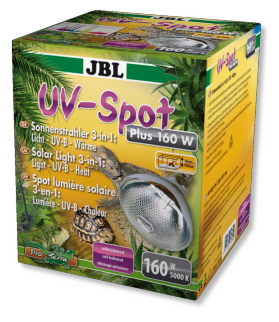
JBL UV-Spot plus UV spotlight with daylight spectrum for terrariums