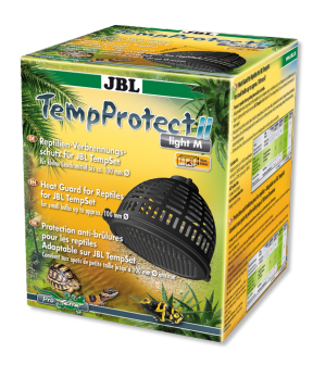
JBL TempProtect II light Reptile thermal burn protection for JBL TempSet items