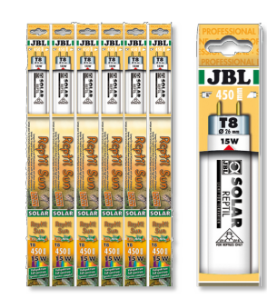
JBL SOLAR REPTIL SUN Τ8 Special T8 terrarium fluoresc. tube for desert animals