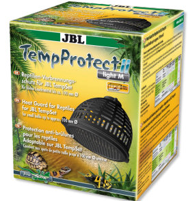
JBL TempProtect II light Reptile thermal burn protection for JBL TempSet items