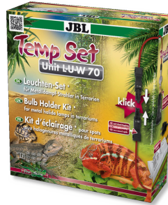
JBL TempSet Unit L-U-W Installation kit for metal-halide lamps