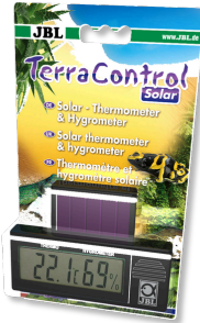
JBL TerraControl Solar Solar-powered thermometer + hygrometer for terrariums