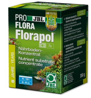
JBL PROFLORA Florapol Long-term nutrient substrate concentrate