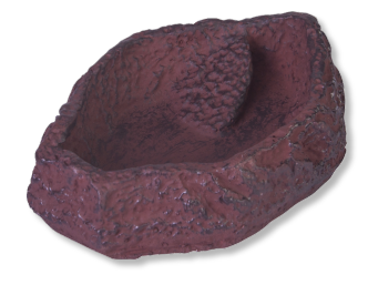
JBL ReptilBar RED Red feeding, drinking, bathing bowl for terrariums