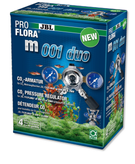
JBL PROFLORA m001 duo Fitting to reduce pressure for 2 CO2 diffusers

JBL PROFLORA CO2 Count Safe Bubble counter with backflow