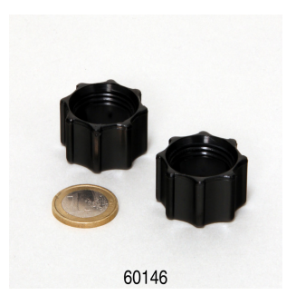
JBL CP e union nut for hose connection