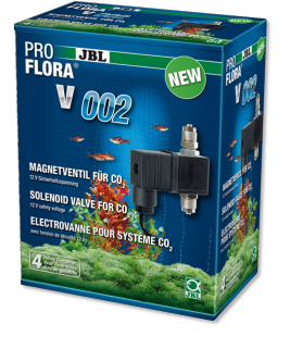
JBL PROFLORA v002 Noiseless solenoid valve