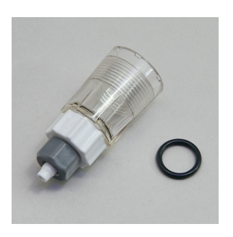
JBL PF Direct bubble counter