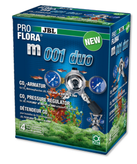
JBL PROFLORA m001 duo Fitting to reduce pressure for 2 CO2 diffusers