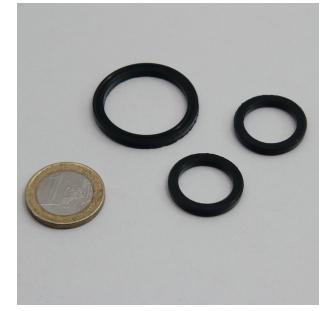
JBL PF Direct seal set