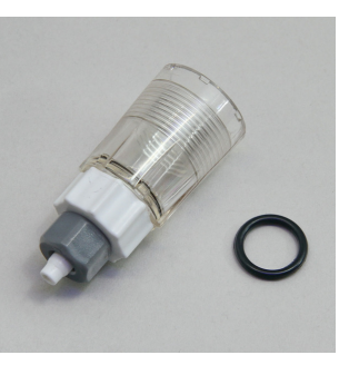
JBL PF Direct bubble counter