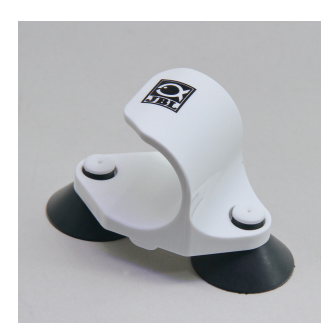
JBL PF Direct mounting, complete