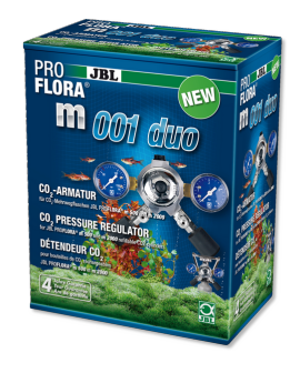
JBL PROFLORA m001 duo

Fitting to reduce pressure for 2 CO2 diffusers