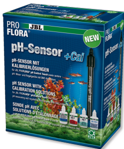
JBL PROFLORA pH-Sensor+Cal pH electrode with BNC connection