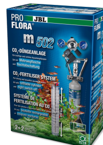
JBL PROFLORA m502 CO 2 plant fertiliser system with night switch-off