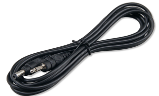
JBL pH Control Touch connection cable