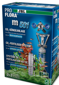
JBL PROFLORA m501 CO 2 plant fertiliser system complete kit