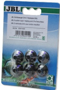
JBL slotted suction cup, 2mm

Holder for heating cables in aquariums and terrariums