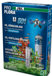
JBL PROFLORA u501 Plant fertiliser system complete kit