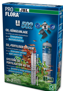
JBL PROFLORA u502 Plant fertiliser system with night switch-off