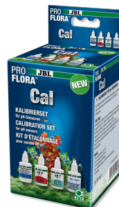
JBL PROFLORA Cal Complete kit for calibration