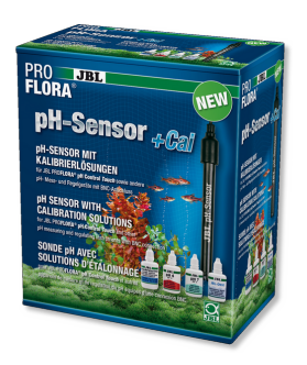
JBL PROFLORA pH-Sensor+Cal